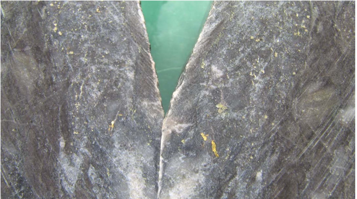
Figure 2: Visible Gold in Diamond Hole 11GYD0005. Yellow specks are Coarse and Fine Gold, Silvery Specks and Veinlets are Sulphides and Dark/Black Veinlets and Blobs are Molybdenite.