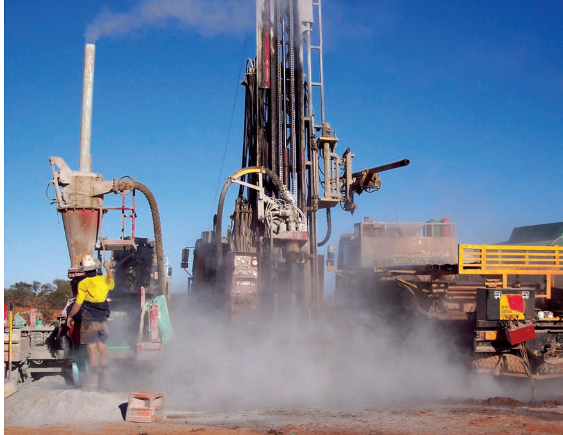
Drilling at Central Bore

base is 95 per cent Australian. Creating a world-class project underpinned by a multi-million ounce resource will definitely put us on the global radar for investors in Europe and the US.”