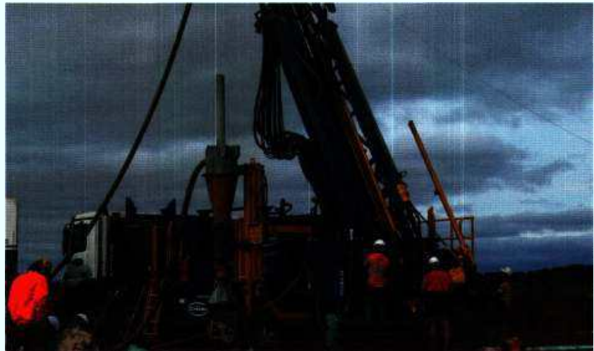
The rig has been out looking for the next multi million oz camp in WA.

Despite the different mineralisation sniffs – including the presence of base metals (and