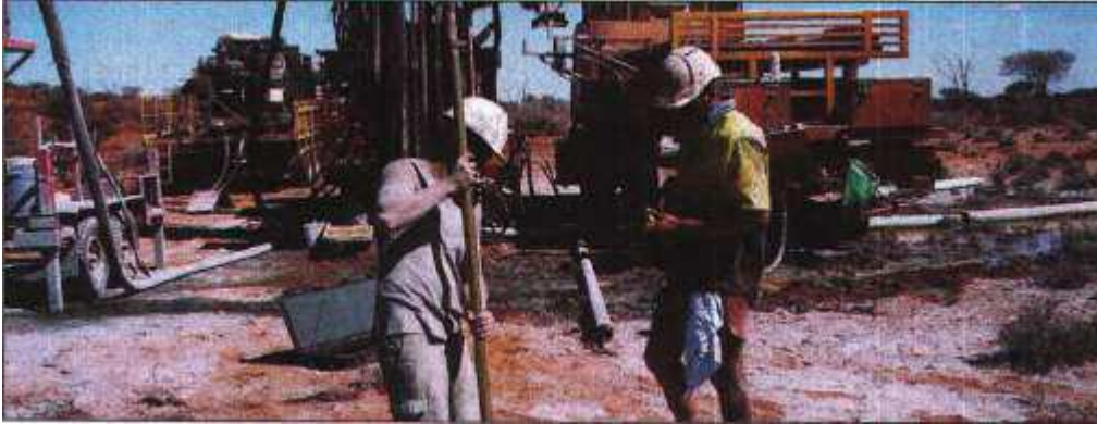
Gold Road Resources' exploration team at work